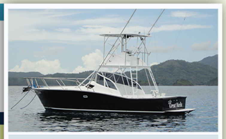
Full Day Offshore: 6 pax Full Day Inshore: 7 pax, $50 p/p (max 8) 1/2 Day: 8 pax, $50 p/p, (max 10 pax)

1/2 DAY $1150 (5 hours) 3/4 DAY $1300 (7 hours) FULL DAY $1500 (9 hours)